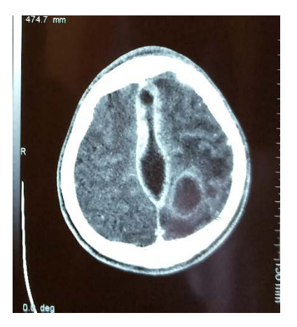
Figure 2. Cranio-encephalic CT scan axial sections after injection of the contrast medium showing a left parietal abscess and interhemispheric empyema association.