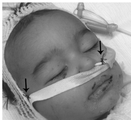
Fig. 2b. Sutures placed to secure NGT to the twill tie and the twill tie to the burn netting