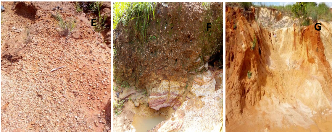
Plate E= Pebbles, F = Pebbly Sandstone having sharp contact with Kaoline and G= Sand, outcrops occurred at Oziza, Afikpo Basin

Mica: Mica is a phyllosilicate rock forming mineral. It is mostly associated with magma and hydrous in nature with sheet like structure. Muscovite (potassium mica), biotite (magnesium-ion mica), phyllogopite (magnesium mica) are mostly of very high economic values. The rocks