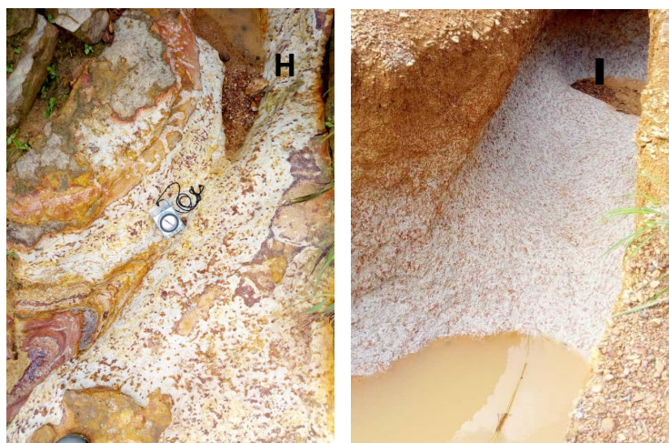
Plate H and I=Shows the kaolinitic clays of the study area (Oziza, Afikpo Basin)

Hematite: hematite is an ore of iron. Iron ore is a raw material in the production of iron. It is used in steel and automobiles industries. Iron ores are also used in construction industries. Hematite is used in paint industries.