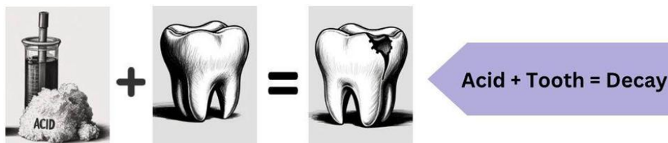
Fig. 3. Tooth decaying Acid + Tooth = Decay