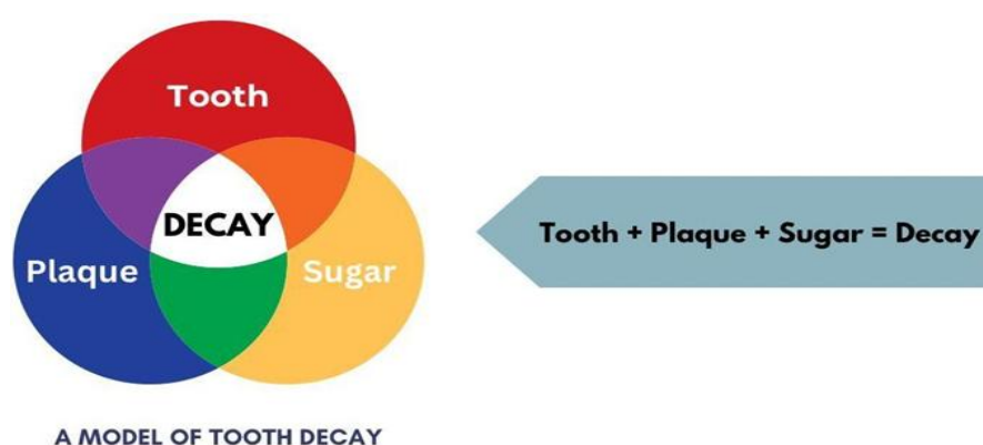
Fig. 4. Model of tooth decay Plaque + Sugar + Tooth = Decay